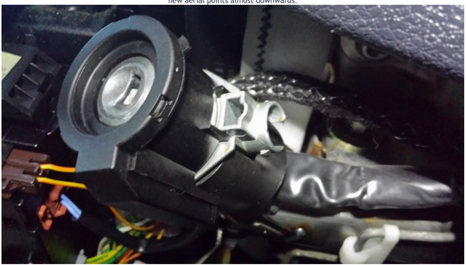
Check your work by starting the car a few times, all should be well. Reassemble the lower panel & you're done.

Fitting is easy too. With the cut out above towards the dash, it slips over the metal part of the barrel, the black chunky part of the new aerial points almost downwards: