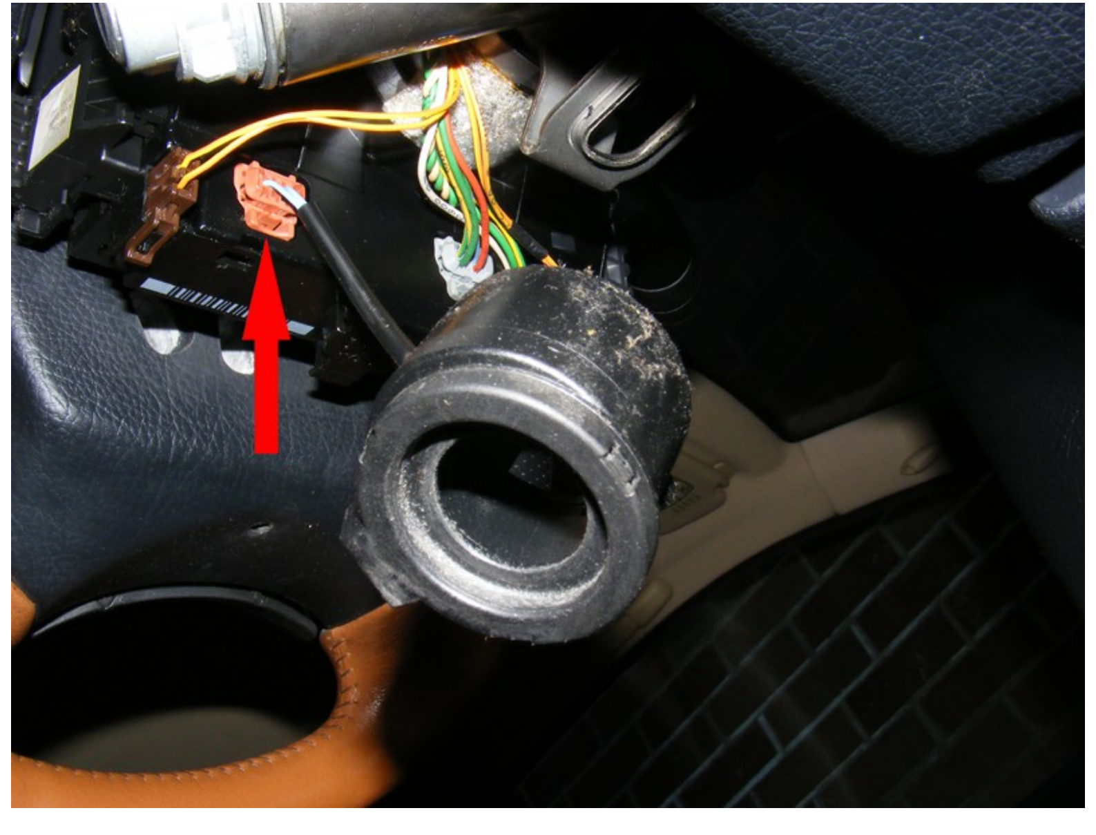
At this point the batteries in the camera died, I resorted to the phone & the battery was low so wouldn't operate the flash, hence the torch.

Once disconnected, carefully grab the front part of the ring & wiggle it off. Here you can see a cut out on the side: